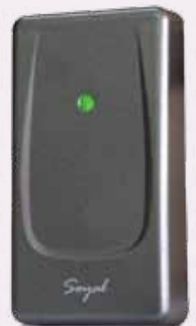
AR721U Auxiliary Wiegand reader