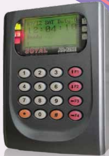
AR829E Controller with built-in reader