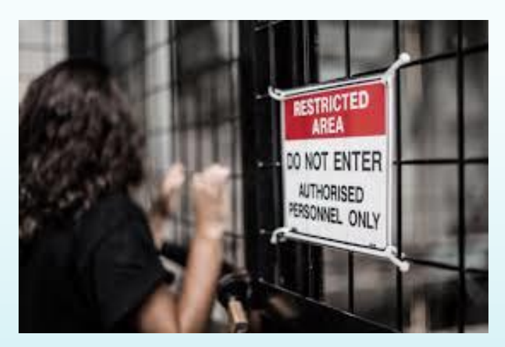
Restricted Area Protection

Draw the ROI around larger campus or certain area (e.g. solar farm, conservation area), protecting and avoiding the specific objects (person, vehicle, or animal) from entering.